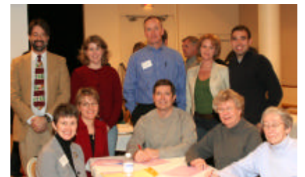
Vision Awareness Team

We look forward to this fun and exciting day in the life of Zion. See you on April 24, Vision Awareness Sunday!